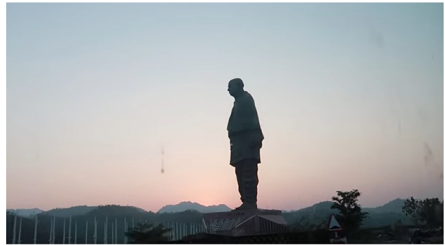
Picture 3: Statue of Unity, as seen from the highway